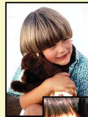
Michigan Child Identification Program